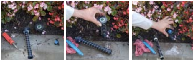
Easily retrofits to Rain Bird 1800 Series

Why pay for a body you're just going to throw away? I-PRO offers a 4", 6" and 12" replacement spray head that is everything but the body! Ideal for maintenance, this spray head also fits right in the can of the Rain Bird® 1800® Series for an easy retrofit. With features that are contractor-driven and field-proven, the I-PRO Series is sure to save you time and money.